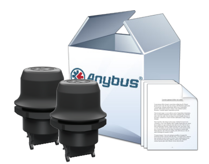
Order a Starter Kit! Includes: Two Wireless Bolts, Power Supply (world), cabling, Quick Start Guide. Order code: AWB2300

Anybus® is a registered trademark of HMS Industrial Networks AB, Sweden, USA, Germany and other countries. Other marks and words belong to their respective companies. All other product or service names mentioned in this document are trademarks of their respective companies. Part No: MMA434 Version 16 05/2018 - © HMS Industrial Networks - All rights reserved - HMS reserves the right to make modifications without prior notice.